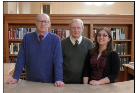
Our Reference Attorneys

The Reference Department can help answer your legal research questions, point you in the direction of a specific resource, assist with locating forms and other materials. They can be reached via phone (617) 226-1520 or email reference@sociallaw.com .